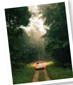
The road less travelled...

Spending a day in Eungella is easy, both Peases Lookout and Sky Window offer spectacular views of the Pioneer Valley