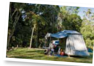
Camping at Broken River Bush Camp

If you're not set on rushing home, soak up the best Eungella has to offer. Choose your accommodation style: camping, B&B, cabins, hotel or resort.