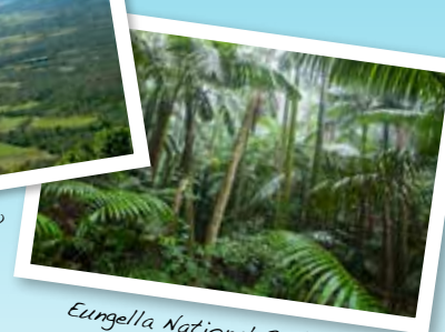
Eungella National Park