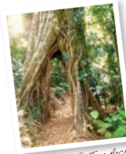
Strangler Fig Tree Arch on Cedar Grove track

History information boards are on display at most businesses and community facilities throughout the area. Further information is available at www.history.eungella.com.au