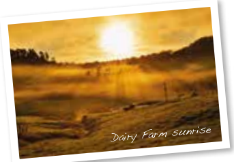
Dairy Farm sunrise

It is here you will find viewing platforms, an information centre, amenities and cafe with refreshments. This part of Australia is recognised as the world's most reliable location for observing platypuses in the wild.