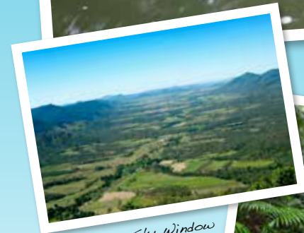
View from Sky Window