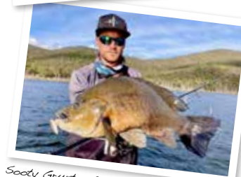
Sooty Grunter fishing at Eungella Dam

Perched high on the Clarke Range, Eungella Township is the hub for one of Queensland's most extensive protected areas encompassing Eungella National Park and Crediton State Forest. Eungella has a rich cultural history of gold mining, timber, dairying and tourism. The National Park showcases a huge expanse of magnificent sub-tropical rainforest spanning rugged gorges and escarpments. In addition to the 57km Mackay Highlands Great Walk, there are 25kms of graded walking tracks, featuring stunning mountain and rainforest scenery. Tracks range in length and level of challenge from a 300m wheelchair accessible track to an 8km one-way class 4 hike.