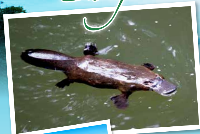
Platypus at Broken River